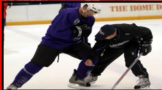
ABOVE: TEACHING NHL SUPERSTAR SIDNEY CROSBY

HURRY & SIGN-UP...THIS PROGRAM STARTS SOON! SKATING COACH TO THE NHL STARS!!!