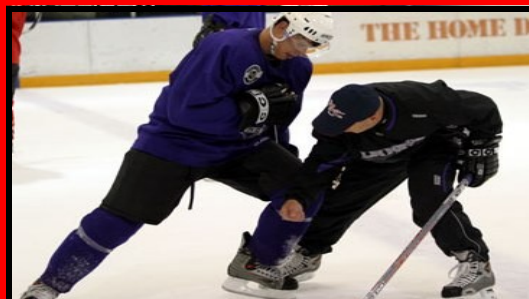
ABOVE: TEACHING NHL SUPERSTAR SIDNEY CROSBY

HURRY & SIGN-UP...THIS PROGRAM STARTS SOON! SKATING COACH TO THE NHL STARS!!!